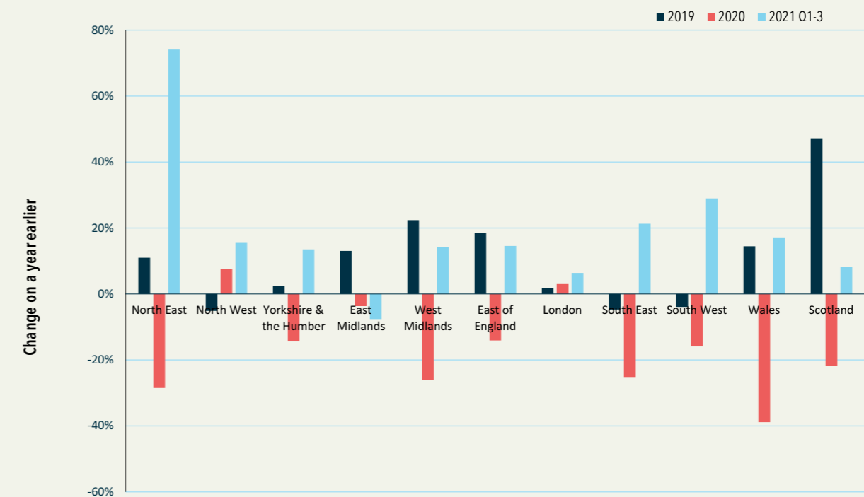
Chart 2: Residential planning approvals by region (No. of units)

Most parts of the UK saw a softening in unit approvals during the third quarter against the preceding three months, with the East of England, Yorkshire & the Humber and Wales the only regions to see growth with increases of 25%, 14% and 19% respectively. The sharpest declines were in the North East, London and Scotland with falls of 59%, 40% and 40% against the preceding quarter. The East of England (+4%) and the South West (+12%) were the only two regions with the number of units approved up on a year ago.